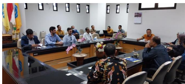
Picture 6. Management Audit of SSB RMF UNY

Regarding the evaluation of management performance itself, according to the results of the management performance assessment carried out by ASKAB PSSI Sleman SSB Real Madrid Foundation UNY, it is still lacking in terms of financial management, management of competitions or contests and management of additional activities.