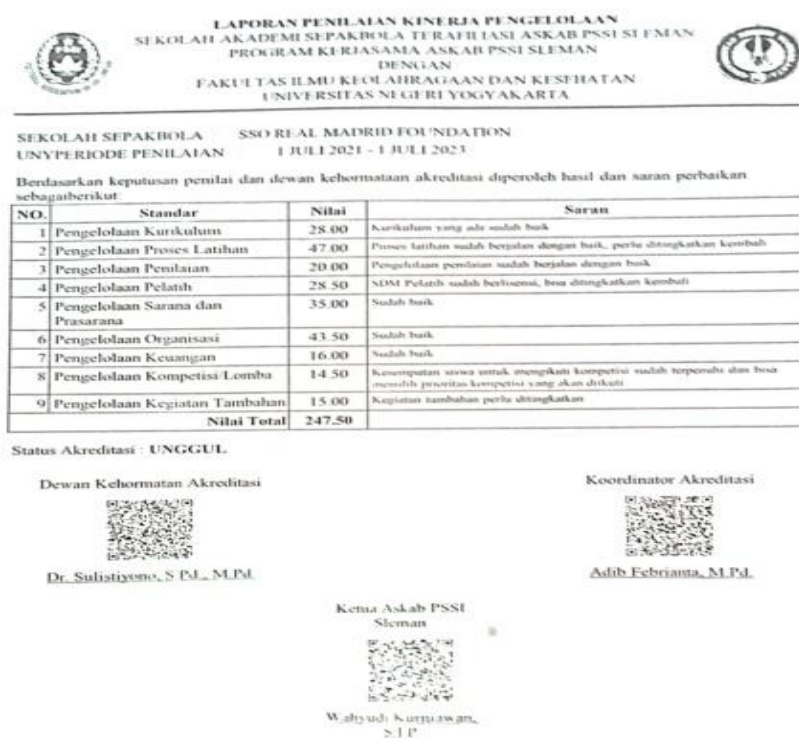
Picture 2. Results of the performance assessment of the management of SSB RMF UNY