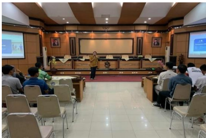
Picture 9. Routine Meeting of SSB RMF UNY Managers and Trainers

Based on data obtained by ASKAB PSSI Sleman, it is recorded that SSB Real Madrid Foundation UNY has an accreditation rating of 247.5 and is included in the "Excellent" accredited category. The second highest position is occupied by SSB Tunas Muda Sleman with an accreditation rating of 172. The third highest position is occupied by SSB Gelora Muda with an accreditation rating of 155.5. This SSB assessment is an effort to improve the quality in the management process of the Real Madrid Foundation UNY Football School. Management of a Football School (SSB) requires management based on a Quality Management System. This assessment is carried out with a Quality Management System which is expected to be able to produce quality Football School Management. Each SSB must compete to meet each standardization that has been arranged in the quality standards set by ASKAB PSSI Sleman. The quality standards that have been formalized are a description of the overall conditions and characteristics of input, output process, results, and consequences. Therefore, SSB Real Madrid Foundation UNY still has to pay special attention to its management in order to continue to be a quality SSB.