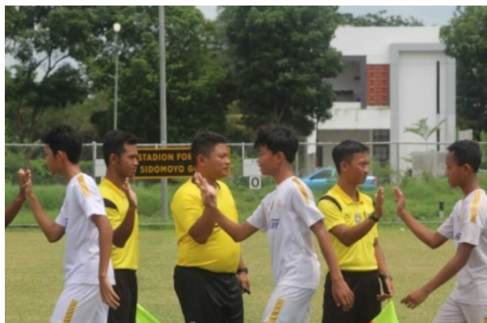
Picture 8. ASKAB PSSI Sleman Youth League 2023