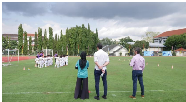
Picture 7. Monitoring of SSB RMF UNY Activities