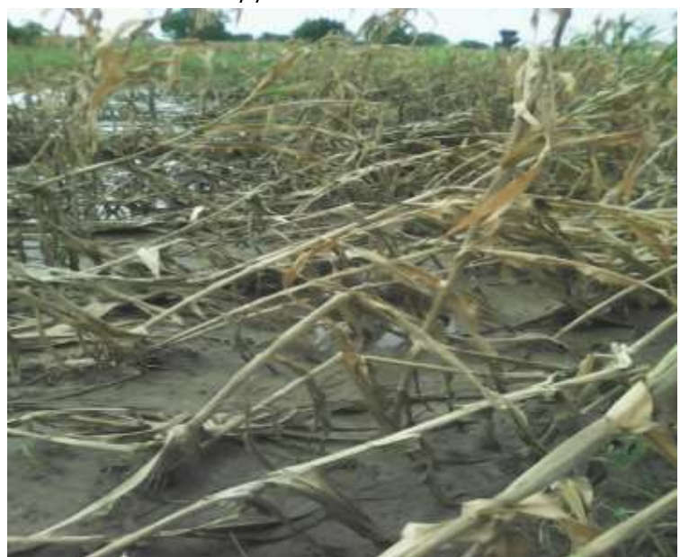
Fig 6. Rotten crop after flood

days, they will get rotten (see Fig 6). This information was complimented by the regular visit to the affected farms. It was observed that, the flood normally come at a time when most of the cereal crop are ready for harvesting. When they are submerged for the duration of the flood period, they normally get rotten (see Fig 6). It was noted from an informant that after the flood, such food stuff cannot be used for anything apart from feeding animals and fowls. Again, this assertion is in consonant with Frederick et al (2010) findings on the amount of food items loss every year to flood.