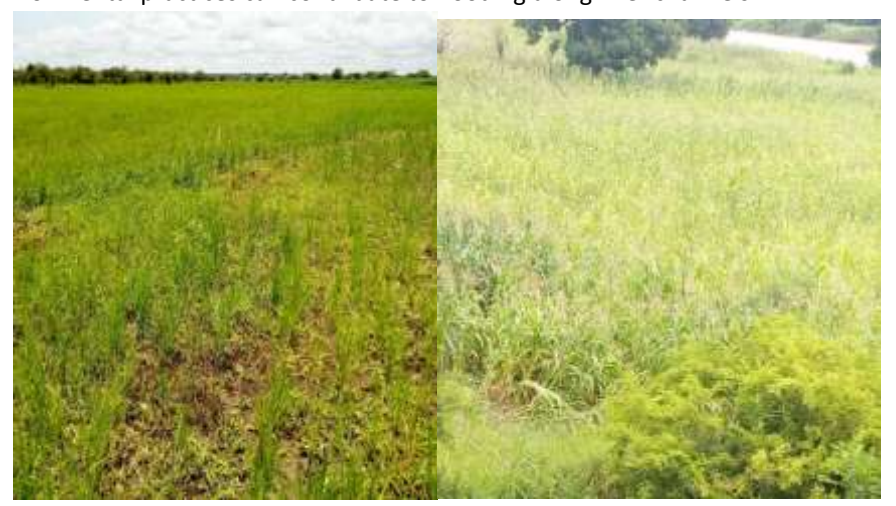
Fig 2. Nature of human activities on the river

The buffer zone which serves as a limit with regards to human activities in the catchment area of the river was ignored (see Fig 2.). In an interview with the NADMO Coordinators in both districts, they indicated that, a buffer of 1000m around the river has been designated which forbid any form of farming activities within this zone. However, this was ignored as farmlands were seen in the buffer zone. Because of these inappropriate farming activities both in the dry and rainy season, it has resulted in massive erosion on the banks of the river leading to siltation of the river. This has made the river shallow thereby reducing the volume of water that it can contain. This confirm the issues raised by Agyemang (2013) and Osei (2013) in the conceptual framework on how these indiscriminate environmental practices can contribute to flooding along river channels.