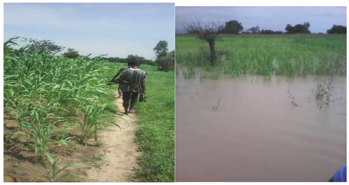
Fig 4.(a) Farmland before the flood