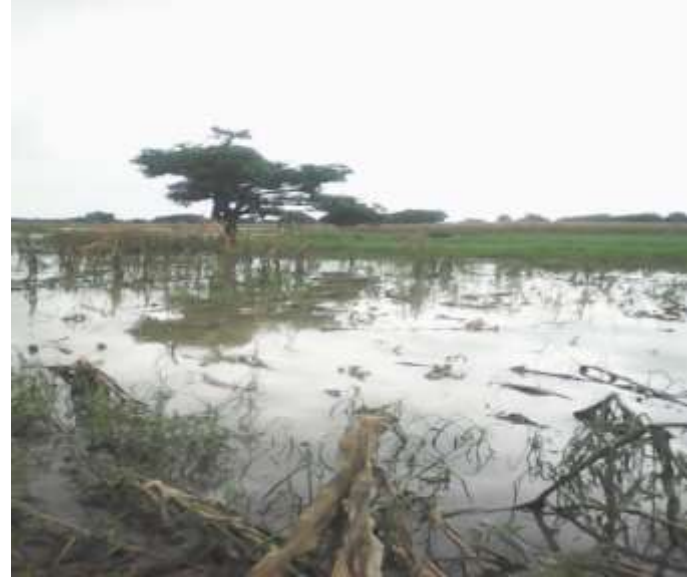
Fig 5. Farmland washed away by flood

The second mode of destruction takes the form of complete washing away of the crop. According to the informants, this happens when the crop are still young or ready for harvesting (see Fig 5). In most of the communities visited especially in Yarigu, farmers after harvesting the early maize in the months of July and August would clear the land again and plant crop such as soya beans, beans, groundnuts and tobacco. When the floods occur, these crop are washed away because, at that time, they will either still be in the germination stage or have not developed enough roots to withstand the flood waters. This explanation resonates with WaterAid (2007) and Frederick et al (2010) findings on how farm lands are usually washed away during floods event in the Northern part of the country. In an interview with a farmer who only farm around the river with no other farmlands elsewhere to support his family members laments that:-"when I plant the early maize and harvest them, I sell some and use that money to clear the land to plant beans, groundnuts and soya beans. My households will depend on the maize until these crops are ready in December and we sell them to buy additional maize to supplement us until the next rainy season. But when these crops are destroyed, my households usually suffer food shortage"