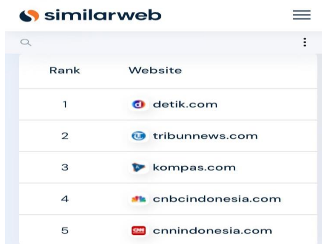
Figure 2. Ranking website news and media publisher in Indonesia