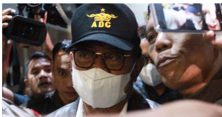
Figure 3. Syahrul Yasin Limpo during his investigation

Publication time: October 13, 2023 at 19.22 WIB