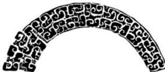
Figure 5. Continuous Fret pattern

The composition form of the plane line of sight pattern is full and complete, occupying a major position on the whole, and can fully show the content and ideas that you want to express in the picture. It is widely used in the depiction of scenes. It is divided into one or several parts in an orderly manner from a head-up perspective. Each part expresses different meanings of patterns, although the content in different parts is different. But they will form a new unity and feeling with each other, which is interesting. Its composition method is different from that in the early days, and it can better show the life at that time. As shown in Figure 6, the decorative scene depicted on the Yanle copper pot is a pattern using a plane perspective. Each part expresses different content, and the composition effect is complete and unconstrained, and each has its own characteristics.