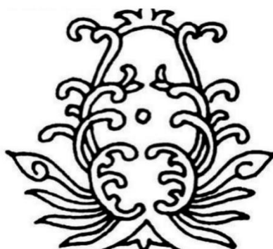
Figure 3. symmetrical plant pattern

The pattern of a single pattern refers to the main pattern on the utensil as an independent form of expression, specifically using a pattern to express the interpretation of the beautiful meaning on the utensil. The use of this pattern will be more stringent in terms of point, line, and surface requirements, and in the process of drawing, it needs to be adapted to the shape, color, size and other factors of the object to be drawn. In use, it should cooperate with the utensils and complement each other to avoid a series of problems caused by the inconsistent effect of pattern decoration. The more common composition methods of a single pattern are mainly asymmetric and symmetrical. Symmetrical composition brings people a comfortable feeling (As shown in Figure 3), while asymmetrical composition is more flexible (As shown in Figure 4). The use of cloud patterns is mostly asymmetrical patterns, most of which are delicate and diverse, and the styles are also much richer and more different.