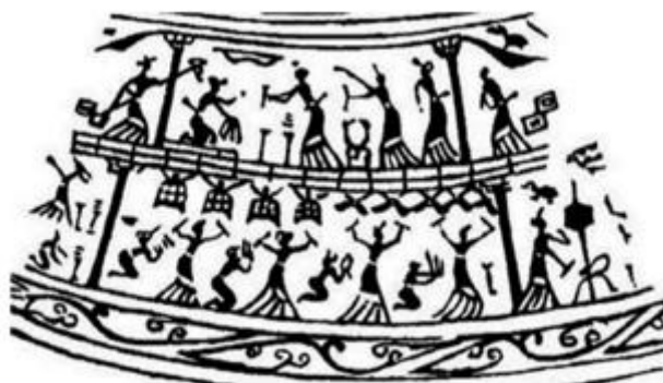
Figure 6. "yanle" Copper kettle

Chinese traditional patterns are one of the representatives of traditional culture. The purpose of analyzing the significance of Chinese traditional patterns in arts and crafts is to spread the ancient Chinese culture, understand the creation methods and wisdom of ancestors, and get some inspiration from it. In modern society, the development of patterns requires us to adopt innovative methods to inherit, extract the refined elements for creation, obtain a new way of expression, and use them flexibly.