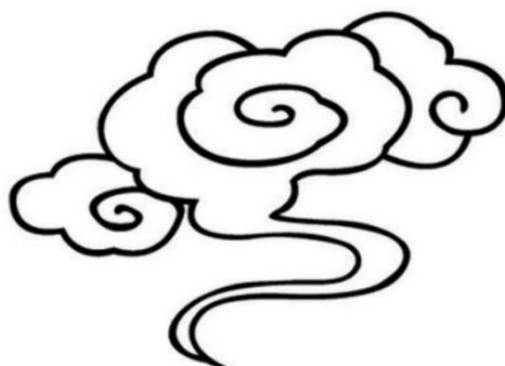
Figure 4. asymmetrical cloud pattern