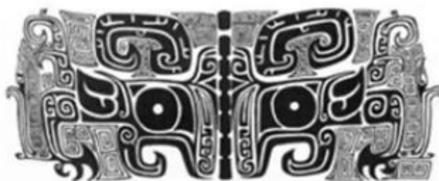
Figure 2. Shang Dynasty bronze pattern