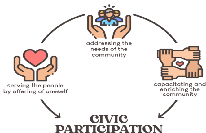
Figure 1. Definition of Civic Participation

The participants defines civic participation as offering of oneself in service to the community and its people by addressing their needs and maximizing their potentials (see Figure 1). Offering of oneself pertains to the skills, time, and effort one is able and willing to give as a volunteer. This definition of civic participation grows broader and deeper as one gains more experiences which therefore provides deeper understanding of the situation of the community and its people. Through volunteering, volunteers put great importance to their experience working with the community. Experience involves learning the lives of their fellow Filipino people and the community’s situation including their potentials. Civic participation for the volunteers goes beyond from just giving aids, it is to empower fellow Filipino people and uplift the community.