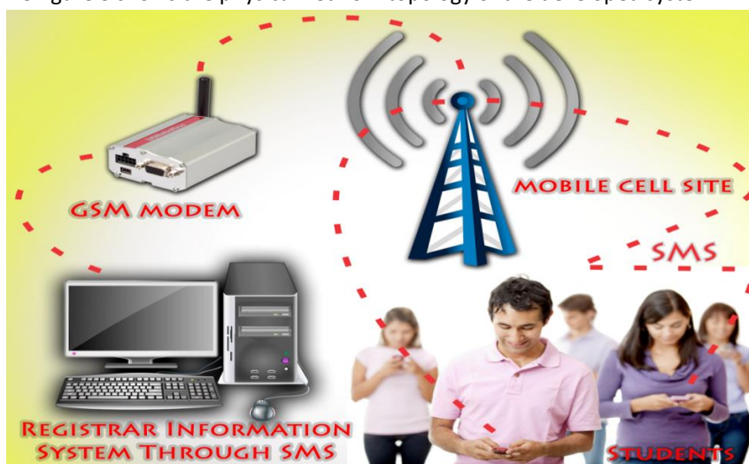
Figure 3: Physical Network topology of the proposed system.

When a GSM modem is connected to a computer, this allows the computer to use the GSM modem to communicate over the mobile network [9]. While these GSM modems are most frequently used to provide mobile internet connectivity, it is used for sending and receiving SMS and MMS messages for the developed system that allows the students to receive a notification about their academic records. The figure 3 shows the physical network topology of the developed system.