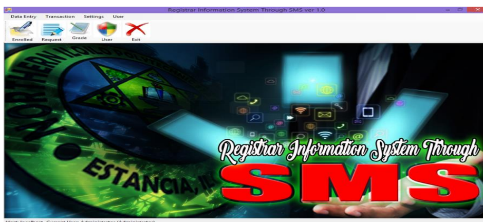
Figure 4. Main form