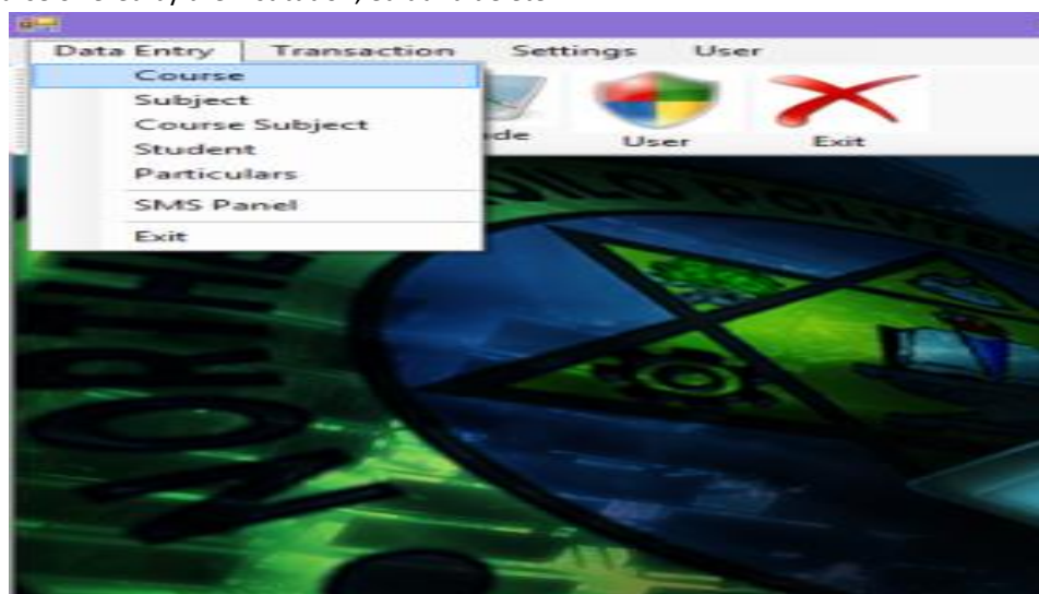
Figure 5. Data Entry

This figure 5 shows the data entry. Under this data entry there's a module they are the course, subject, course subject, students, particulars SMS panel and exit. In figure 4, it shows the form of the course module wherein it displays the course information such as the course code and the course. The user can search into the search code box just encode course code intended for a different course. On the left side of the screen, there are the buttons for the new, edit and delete. The researcher can add the new course offered by the institution, edit and delete.