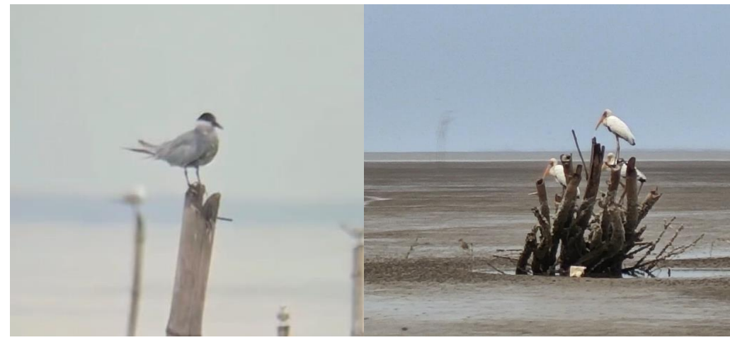
Figure 3. A) Sterna nilotica and B) Mycteria cinerea documented at the observation sites

Based on the threat status records according to the IUCN Red List, 4 bird species have near threatened status (NT or Near Threatened), including Anas gibberifrons , Charadrius javanicus , Anhinga melanogaster , and Limosa limosa . As many as 1 bird species has vulnerable status (VU or Vulnerable), Centropus nigrorufus . In addition, 2 endangered bird species (EN or Endangered) were also found, those were Numenius madagascariensis and Mycteria cinerea . As many as 50 other species have low risk status (LC or Least Concern) [14].