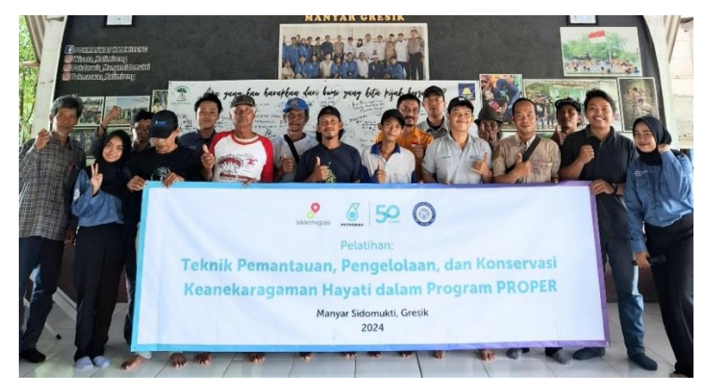
Figure 5. Community-based biomonitoring training

The goal of the training was for both the fishermen and the Petronas field team to acquire a thorough understanding and practical skills in biodiversity monitoring and conservation techniques, reflecting the vital role local communities play in environmental management [22]. By equipping these individuals with advanced knowledge and hands-on experience, the training aimed to foster a sense of stewardship and enable them to actively contribute to the preservation of local ecosystems. Local communities, including fishermen, are often on the front lines of environmental changes and can provide valuable insights and observations about biodiversity [23]. Empowering them with skills in monitoring and conservation not only enhances their capacity to manage natural resources effectively, but also ensures that conservation efforts are more grounded and responsive to real-world conditions [24]. This collaborative approach helps bridge the gap between scientific research and community practice, leading to more sustainable and impactful environmental management [25].