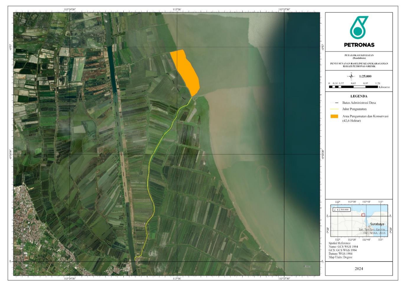
Figure 1. Sampling area in Randuboto

Population sampling and observation were conducted in the fostered area of Petronas Carigali Ketapang II Ltd. The observation locations were divided into two points: the mangrove conservation area of Randuboto Village and the Kalimireng mangrove conservation area in Manyar Sidomukti Village. Biodiversity observation activities in Randuboto Village took place on January 23-24, 2024. Meanwhile, biodiversity observation activities in Manyar Sidomukti Village were carried out on April 19-20, 2024. Vegetation sampling was done during the day while bird observation was conducted twice in the morning at 06.00-08.00 AM and in the afternoon at 02.00-04.00 PM.