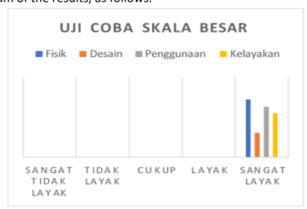
Figure 5 Diagram of Large Scale Trial Results

Based on the table above, the results of the large-scale trial of students on the product of the baseball bat in learning PJOK if displayed in the form of a bar diagram of the results, as follows: