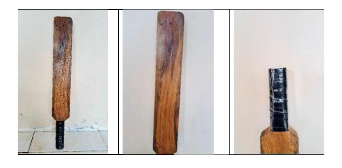
Figure 1 Initial Product Development Results

Product design in this case is intended to make a product "batting tool for baseball". The design of the batting tool is made with a wider size, giving color interest, and changing the handle material on the bat which is more attractive and safe. Researchers make batting tool development products to be tested on media and material experts, so that they have the feasibility to be tested in small and large scale groups. The basic material of the bat is light wood (teak wood). The bat is painted using natural colors and the handle is coated with rubber. The bat is made with an overall length of 40 cm with a flat cross section at the top for ball contact, which is 30 cm long, 6.5 cm wide, 3 cm thick, while the bottom for the handle is 10 cm long, 2.5 cm wide, and 3 cm thick. cm, and 3 cm thick. The weight of the batting tool weighs 0.340 g. The product design of the development of a batting tool for the dynasty game in question, namely: