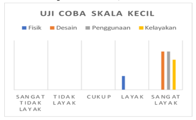
Figure 4 Diagram of Small Scale Trial Results

Based on the table above, the results of the small-scale trial of students on the product of the batting tool for the dynasty game in PJOK learning if displayed in the form of a bar diagram of the results, as follows: