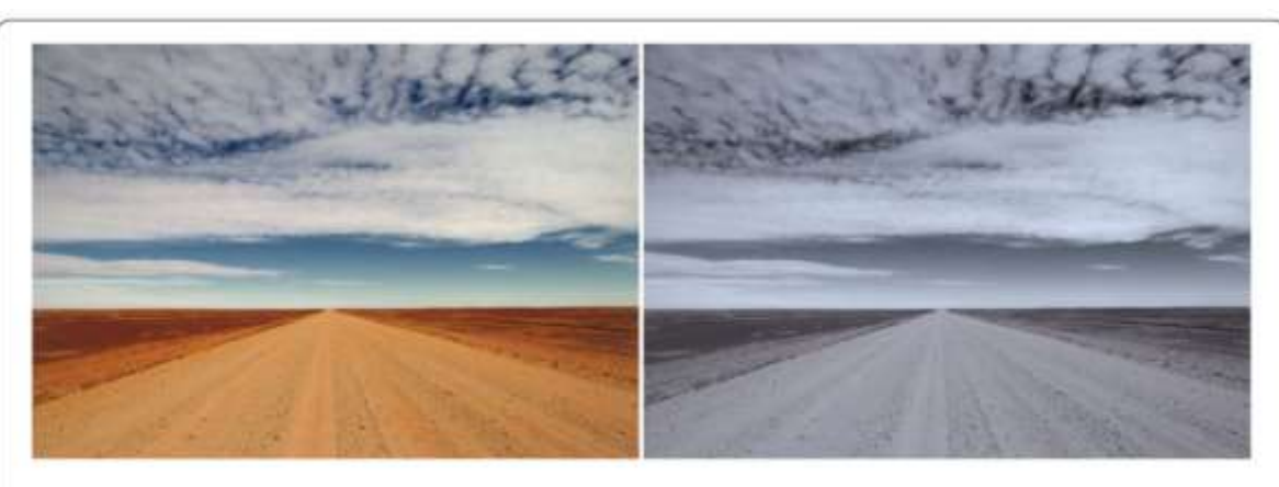
Figure 1 Comparison of HSV values. Right photograph has higher Hue (bluer), lower Saturation (grayer), and lower Brightness (darker) than left photograph. Instagram photos posted by depressed individuals had HSV values shifted towards those in the right photograph, compared with photos posted by healthy individuals.