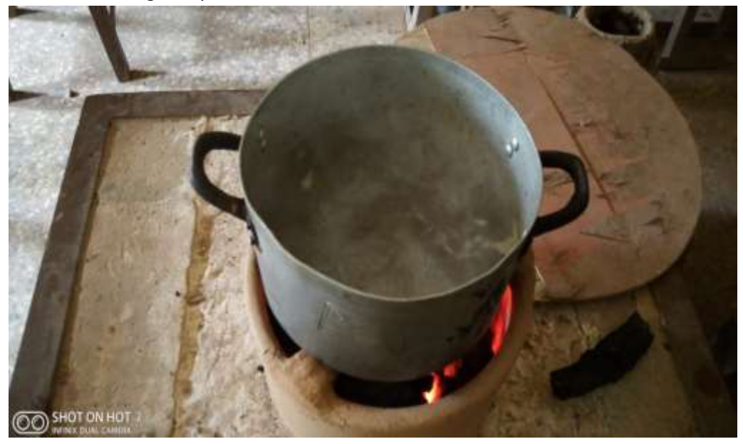
Plate 6: Boiling of water with the stove

The entire process of cooking/boiling water with the stove took about 30mins. This involves the use of charcoal inside the stove and another boiling of water, after the removal of the smoldering charcoal. During this period, the charcoal which was already lit turned the refractory piece. The charcoal also were reddish, pot was kept on top of the stove with water of about 250ml volume inside of it to boil. At exactly six minutes, the boiling point of the water reached. The water in the pot was poured out and another pot with water inside it was put on the stove, this was after the charcoal has been poured out from the stove,. It took about 24mins for the water to start boiling slowly.