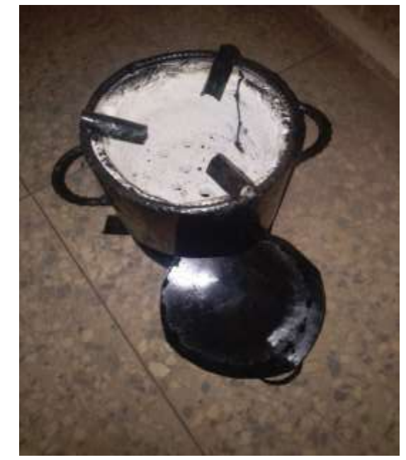
Plate 7: The Stove