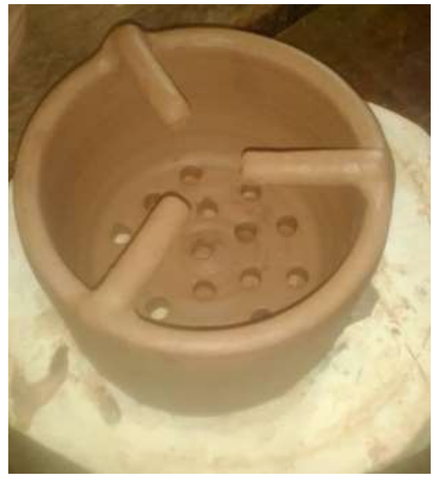
Plate 17: Stove in a green ware stage