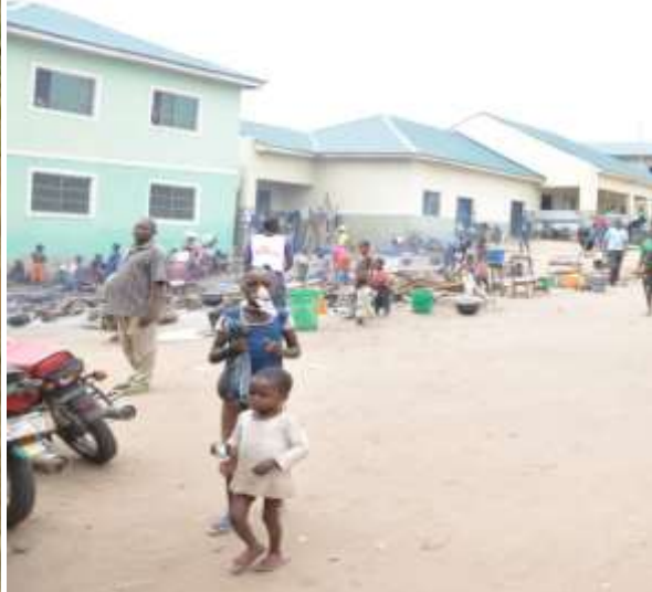
Fig 3: Refugees at IDP Camp, Abagena