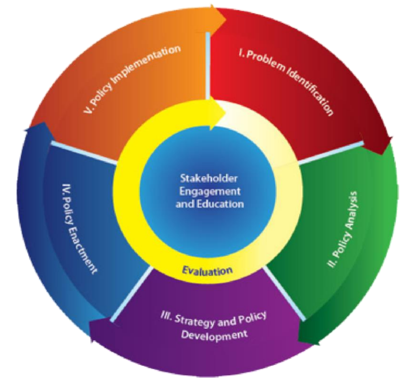
Figure 1. The CDC policy process consisting of the 5 domains for policy evaluation (1)